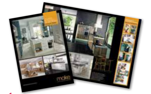
Using the Make Kitchens brochure choose your style range that you prefer.