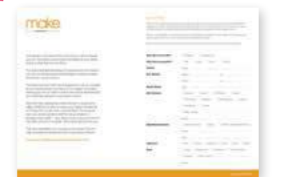
Make notes of codes, colours and in your wish list.