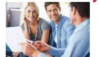
Your design consultant will use your wish list to incorporate products into your dream kitchen design.